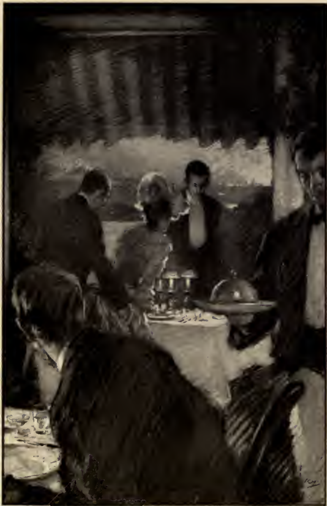
I could see that she was young.